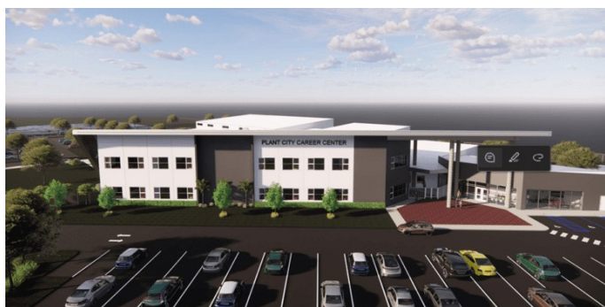
Rendering of the new Plant City Career Center opening in August, 2025 at 1690 East Park Road (just west of Plant City Stadium).

Our next meeting is a Steak Night on Monday, January 20, grill time 6:15, meeting 6:30 pm at the Parks & Rec admin office patio, 1904 South Park Road . Our busy 2025 season kicks off with the Basketball Skills Challenge (Jan 25), Marie B. Ellis Park Celebration and Family Support event (Feb 1), Citizen of the Year Luncheon (Feb 12), High School Graduate Scholarships (entries open in March), Easter Egg Hunt (Apr 19), and Soccer Skills Challenge (Apr 26). Bring a new member candidate and treat them to dinner!