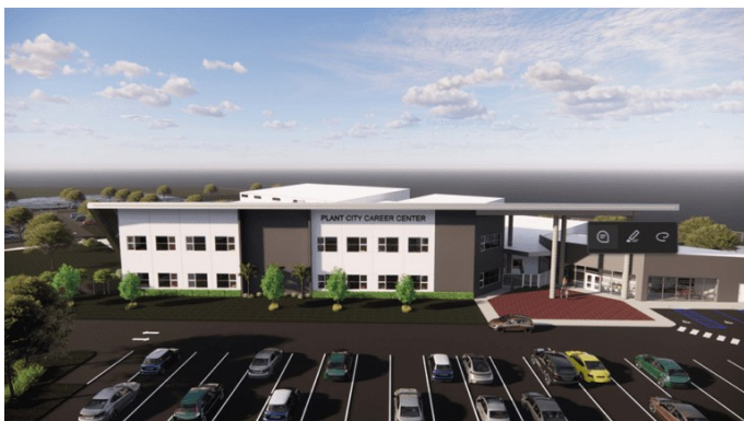
Rendering of the new Plant City Career Center opening in August, 2025 at 1690 East Park Road (just west of Plant City Stadium).